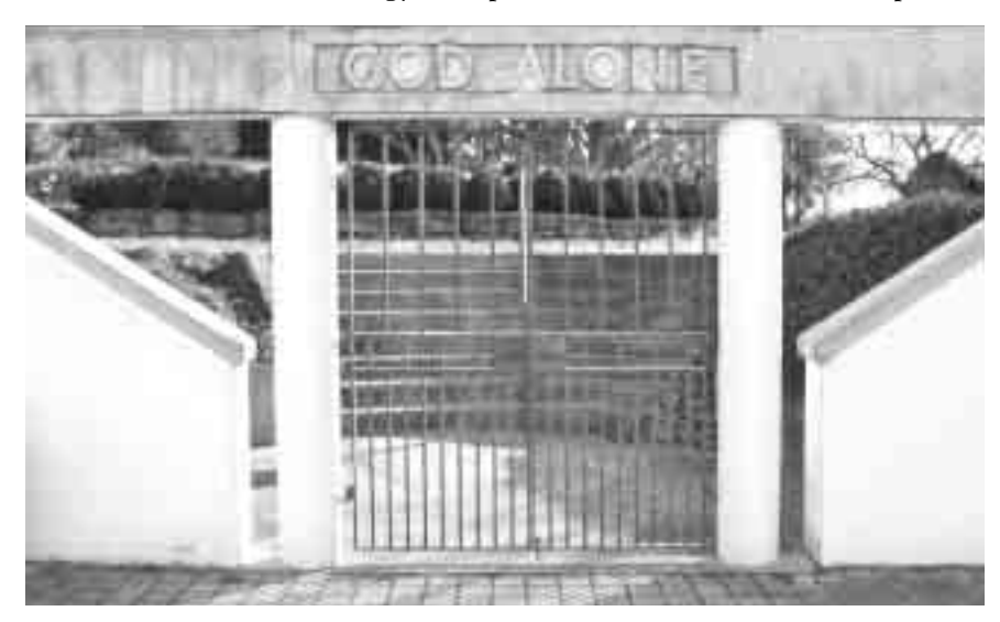
Entrance to the garden of Gethsemani Abbey

In speaking of God Merton relied on the language and images of traditional Catholic theology. He spoke of God, Christ and the Spirit as