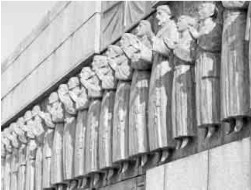
Monument to the Nagasaki martyrs