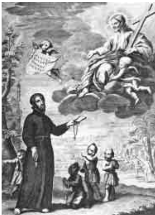
St Francis Xavier

surprisingly, he has been described as the 'Divinely Impatient'. 2 In fact, in one of his letters to Ignatius, who insisted on knowing all that he could of the work of his fellow Jesuits, Xavier tried to justify his pastoral method in some detail. Something made him feel that Ignatius would not look favourably on the speed with which large numbers of people in the south of India were being admitted into the faith of the Church. It was probably in India that Xavier first displayed his pastoral and missionary misconceptions. Narrow, intolerant theology misdirected his zeal into a