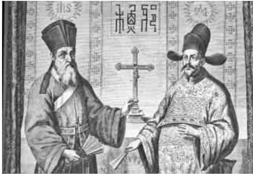
Matteo Ricci meeting the Chinese scholar Hsu Kuangchi

In his philosophical-theological thinking, Ricci opted for an extremely difficult path: he wanted to demonstrate the value and truth of Christianity, using Chinese history and Chinese thought. He had the audacity to call into question the supposed Confucian atheism of the Ming period by quoting texts taken from the original writings. This was an attack from within. The Chinese classical texts were enlisted as allies of Christianity: the earlier wise men were presented as 'perfect' but incomplete. They were thought of as preparatory agents who were opening the way for God's revelation in Jesus Christ. Christianity could fill the void that was left by Chinese sages and Chinese tradition. Ricci's catechism coincided in content with that of Xavier: for Christianity to take root in China it would be necessary to accept the existence of an Almighty Creator God, along with the teachings on the immortality of the soul and the need for a virtuous life (with its reward in the hereafter). Ricci's dialogue catechism, The True Meaning of the Lord of Heaven ( Tianzhu shìyì ), was well received in China, even if it was severely criticized in Europe because of the lack of any explicit mention of the Trinity, the incarnation and redemption. Once again the European professors failed completely to see the incredible effort Ricci had to