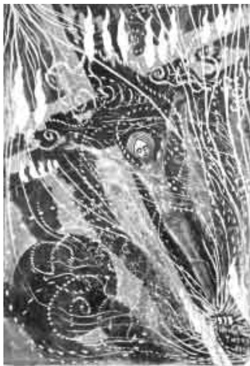
Apocalypse 1968, by Yuri Titov

for psychiatric disturbance in Soviet mental hospitals. Titov is also an artist. Some of his most haunting paintings evoke the power of icons. The face of Christ looks out on a fragmented landscape which represents Soviet life. Barbed wire, a broken candle, the side of a building lit up by fire. The landscape reminds one of the tawdry propagandist art that is common in communist Russia. The face of the icon was wholly traditional. Titov was eventually allowed to leave the Soviet Union for exile in France. I believe that he made it a condition of his release that his work should go with him. His paintings