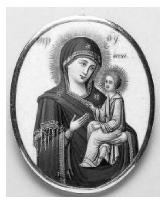
Our Lady of Tikhvin, nineteenth century

appreciation. He, spoke in terms of 'tradition', and resurrected parts of the tradition of English literature that had long slumbered. What he wanted to erase from the memory was very much akin to the Westernisation that Ouspensky and Lossky wanted to erase from the tradition of the icon: an idiom emphasizing self-expression, of a kind that found its highpoint in Romanticism. Instead, Eliot, Ouspensky and Lossky wanted to rehabilitate a more impersonal tradition, working through allusion to an